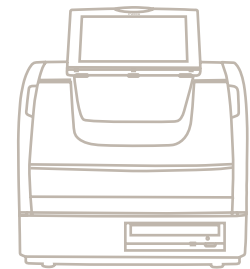
CD-4070NW DIGITAL DOCUMENT RECORDER

As an ENERGY STAR® Partner, Canon U.S.A., Inc. has determined that this product meets the ENERGY STAR® guidelines for energy efficiency. ENERGY STAR and the ENERGY STAR certification mark are registered U.S. marks. Windows is a registered trademark of Microsoft Corporation in the United States and/or other countries. Canon and Canon Know How are registered trademarks of Canon Inc. in the United States and may also be registered trademarks in other countries. IMAGEANYWARE is a service mark of Canon U.S.A., Inc. All other terms and product names may be trademarks or registered trademarks of their respective owners and are hereby acknowledged.