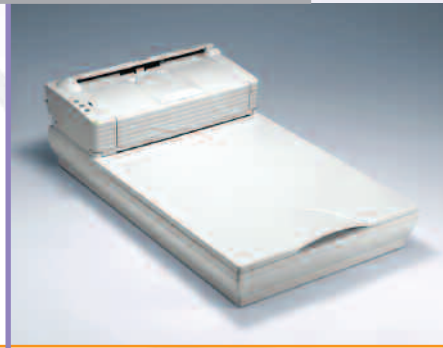
DR-2580C with Optional Flatbed Scanner

The DR-2580C scanner is not only one of the smallest and most versatile in its class, but also incredibly easy to use. For one-touch operation, simply assign your most common functions to its customizable Scan-To-Job buttons. You'll be able to enhance black-and-white scans with the Contrast Adjustment feature that sharpens images and makes text more distinctive on low-contrast documents. And you'll consistently capture high-quality images thanks to 3-Dimensional Color Correction technology, and a built-in shading board automatically adjusts shading prior to each and every scan job.